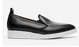
Gigi Hadid's Go-To Shoe Is Surprisingly Affordable Sponsored | WhoWhatWear