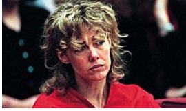
This 35-year-old teacher had an affair with a 12-year-old student. Sponsored | CBS News