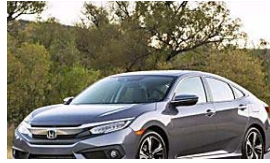
Kelley Blue Book Names the 10 Best-Selling Cars of 2016 Sponsored | Kelley Blue Book