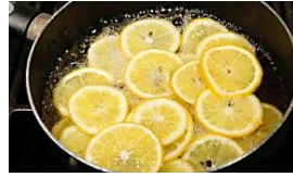
How To Fix Your Fatigue (Do This Every Day) Sponsored | Health Headlines