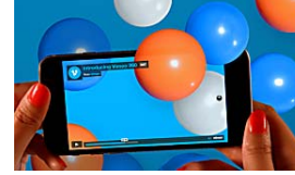
Vimeo is going all in on 360-Degree Video. Join in. Sponsored | Vimeo