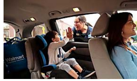
Why Is Everyone Trying Walmart's Grocery Pickup Service? Order Online & Pickup for Free! Sponsored | Walmart