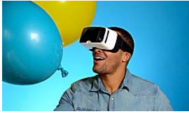
Vimeo's 360-Degree Video Lets Your Story Come to Life Sponsored | Vimeo