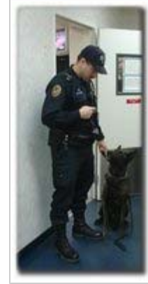
Add A Photo